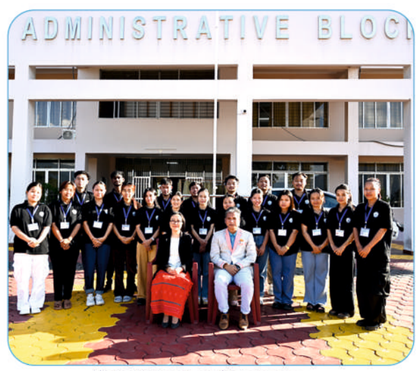
Department of Commerce