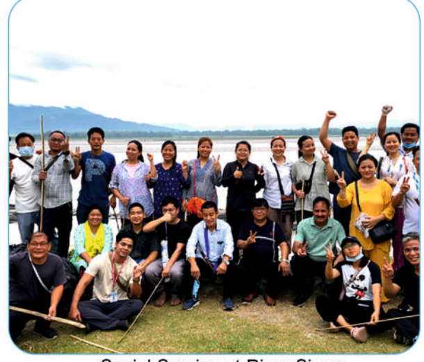
Social Service at River Siang