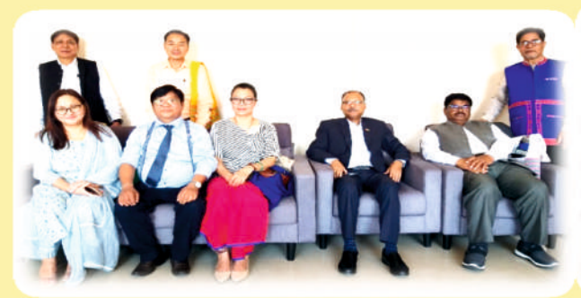
First Executive Council Members