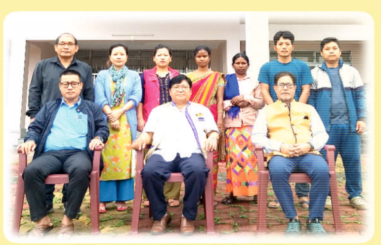
Pioneers of the University