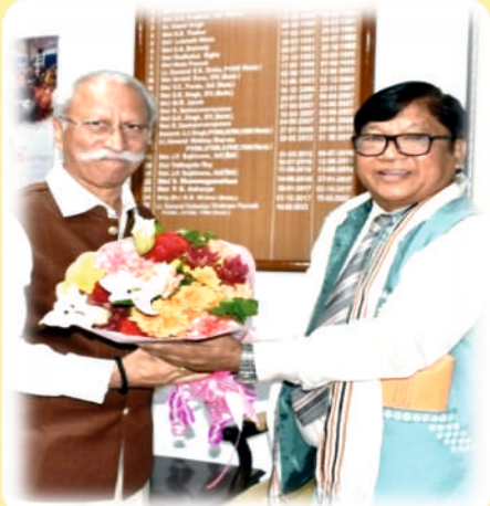
Joining of the First Vice Chancellor at Raj Bhawan on March 14, 2023