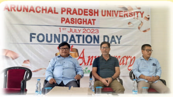
Celebration of Foundation Day of APU on July 1, 2023