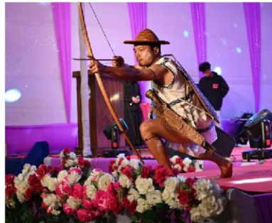
Glimpse of the events of the festival