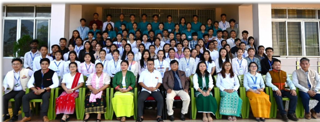
Hon'ble VC, Registrar and Teaching Faculties with the first Batch of Students of the Arunachal Pradesh University