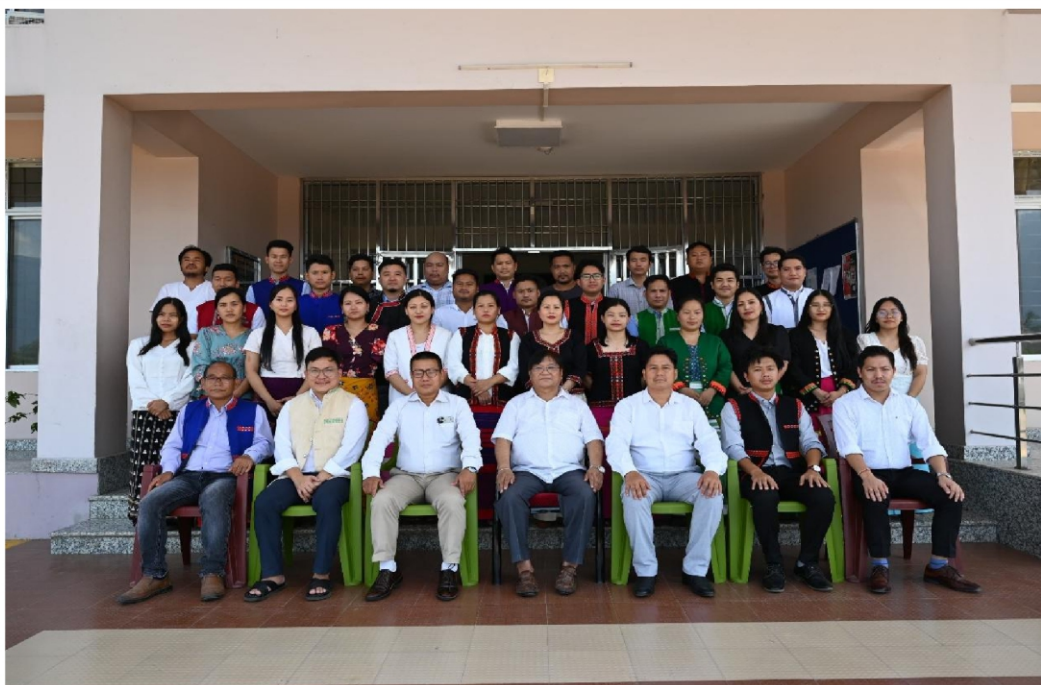
Hon'ble VC with the Administrative Officers and Staff of the University