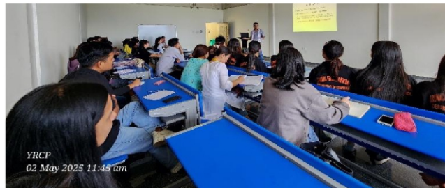
Classroom Ambience of the Arunachal Pradesh University