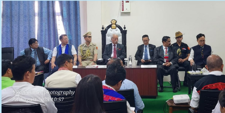
Hon'ble Chancellor & His Excellency, the Governor of Arunachal Pradesh, Lt. Gen Kaiwalya Trivikram Parnaik on the inauguration of Postgraduate Classes (23 rd August, 2023)