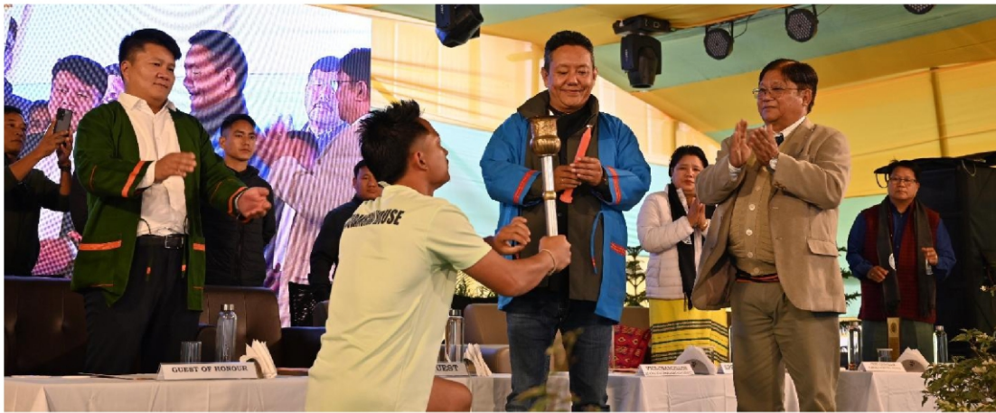
Shri P.D Sona, Hon'ble Minister (Education) of A.P lighting up the torch of the festival