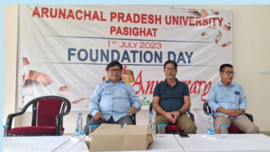
Celebration of 1 st Foundation Day of APU (1 st July, 2023)