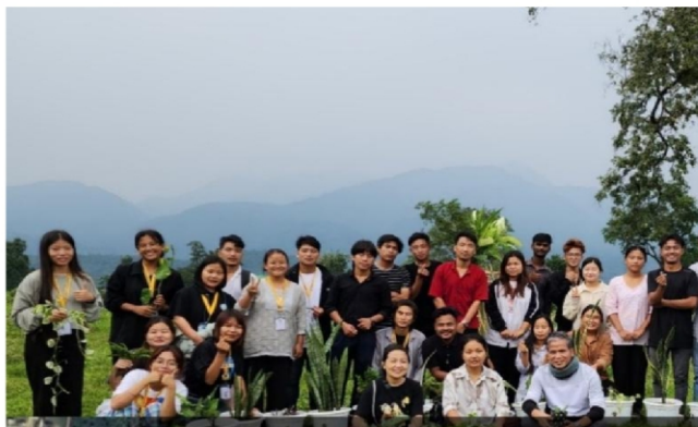
Plantation Drive at the Campus