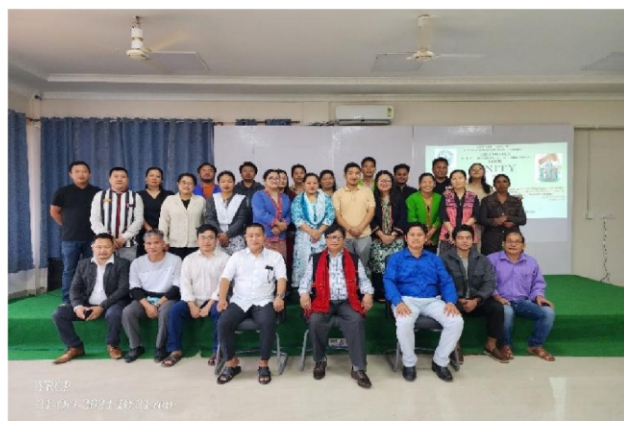
Unity Day Celebration (31 st October, 2024)