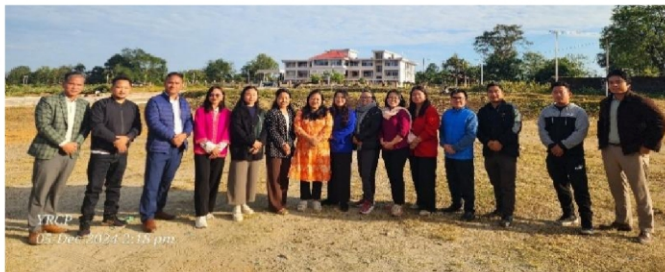
Teaching Faculties at the Campus