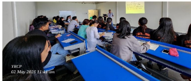
Classroom Ambience of the Arunachal Pradesh University