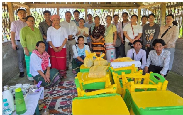
Distribution of furniture to Anganwadi Centre, Pasighat from the University