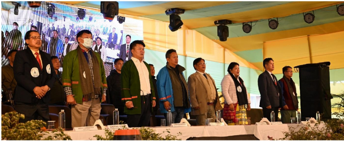
Inaugural Day of the Arunachal Pradesh University Festival, 2025