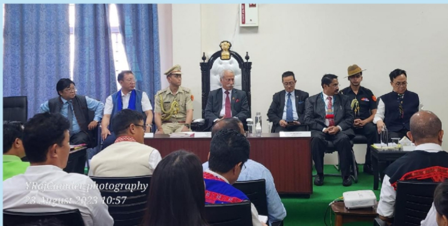
Hon'ble Chancellor & His Excellency, the Governor of Arunachal Pradesh, Lt. Gen Kaiwalya Trivikram Parnaik on the inauguration of Postgraduate Classes (23 rd August, 2023)