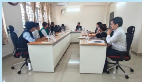
1 st Academic Council Meeting of Arunachal Pradesh University