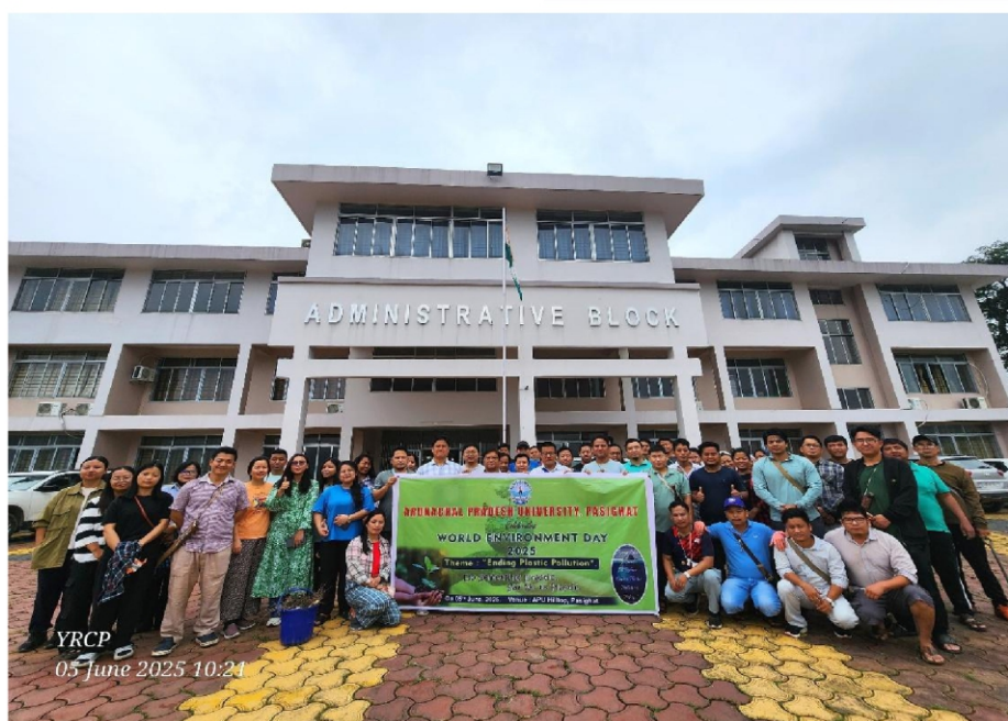
World Environment Day (5 th June, 2025)