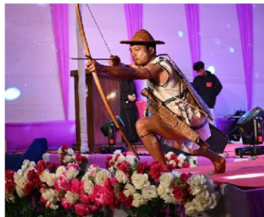
Glimpse of the events of the festival