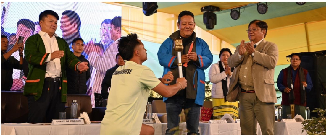
Shri P.D Sona, Hon'ble Minister (Education) of A.P lighting up the torch of the festival