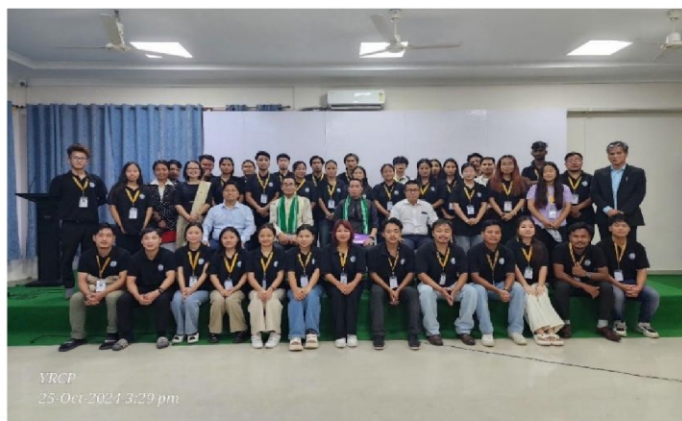
Consumer Awareness Program Conducted by Department of Legal Metrology, Pasighat