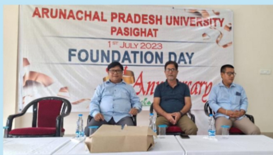
Celebration of 1 st Foundation Day of APU (1 st July, 2023)