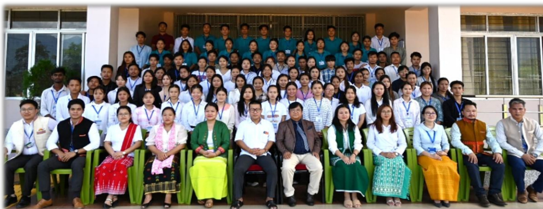
Hon'ble VC, Registrar and Teaching Faculties with the first Batch of Students of the Arunachal Pradesh University