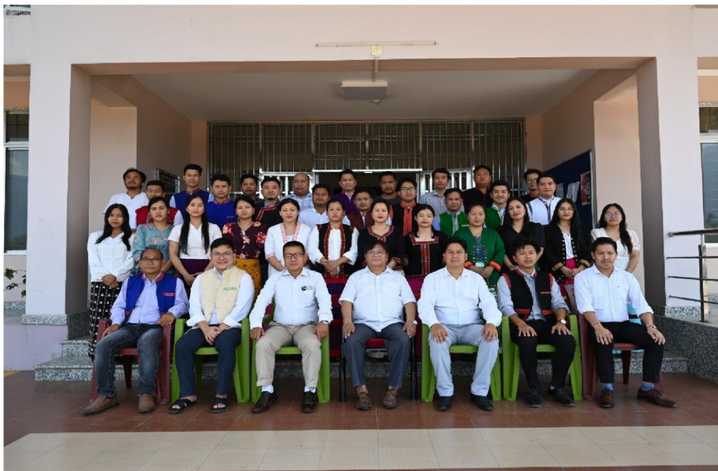
Hon'ble VC with the Administrative Officers and Staff of the University