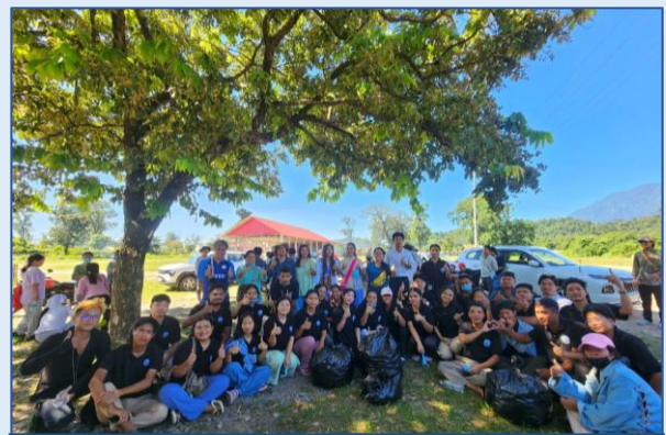
Social Service at Giidi Notko