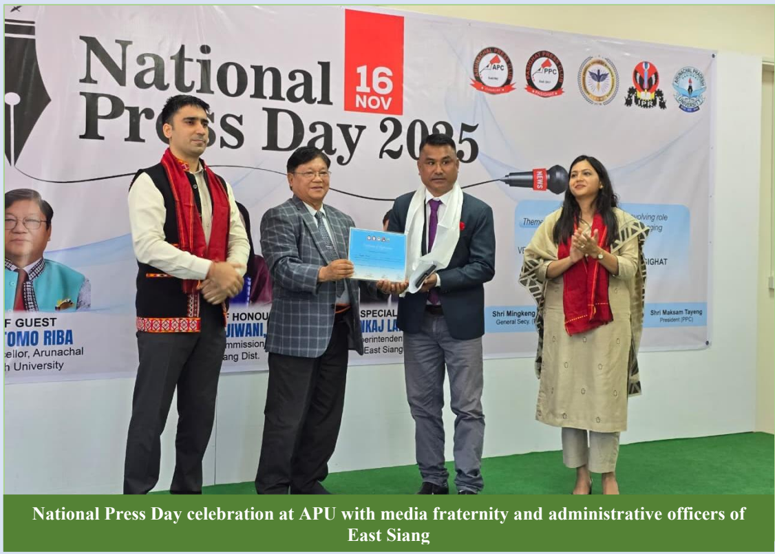
National Press Day celebration at APU with media fraternity and administrative officers of East Siang