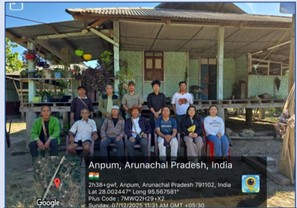
Village Adoption Program