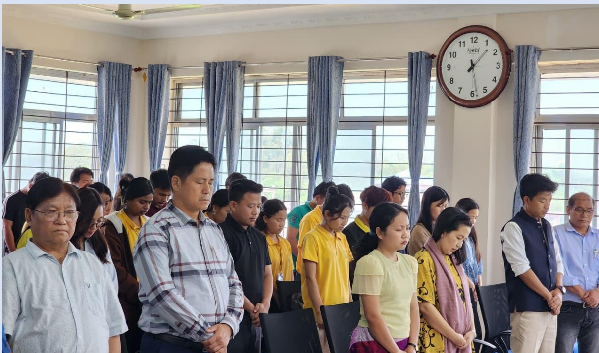
In respect of victims of Pahalgam Terror Attack