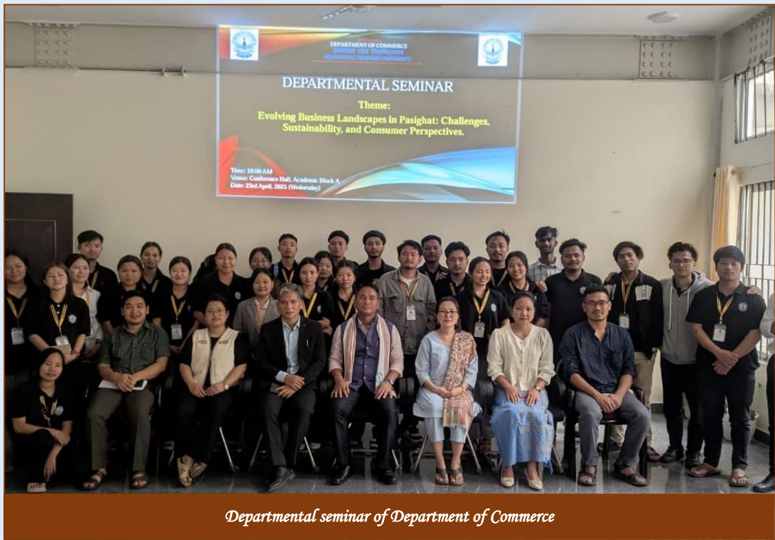
Departmental seminar of Department of Commerce