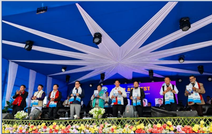
Book release during APUFEST – 2026