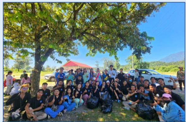
Social Service at Gidi Notko