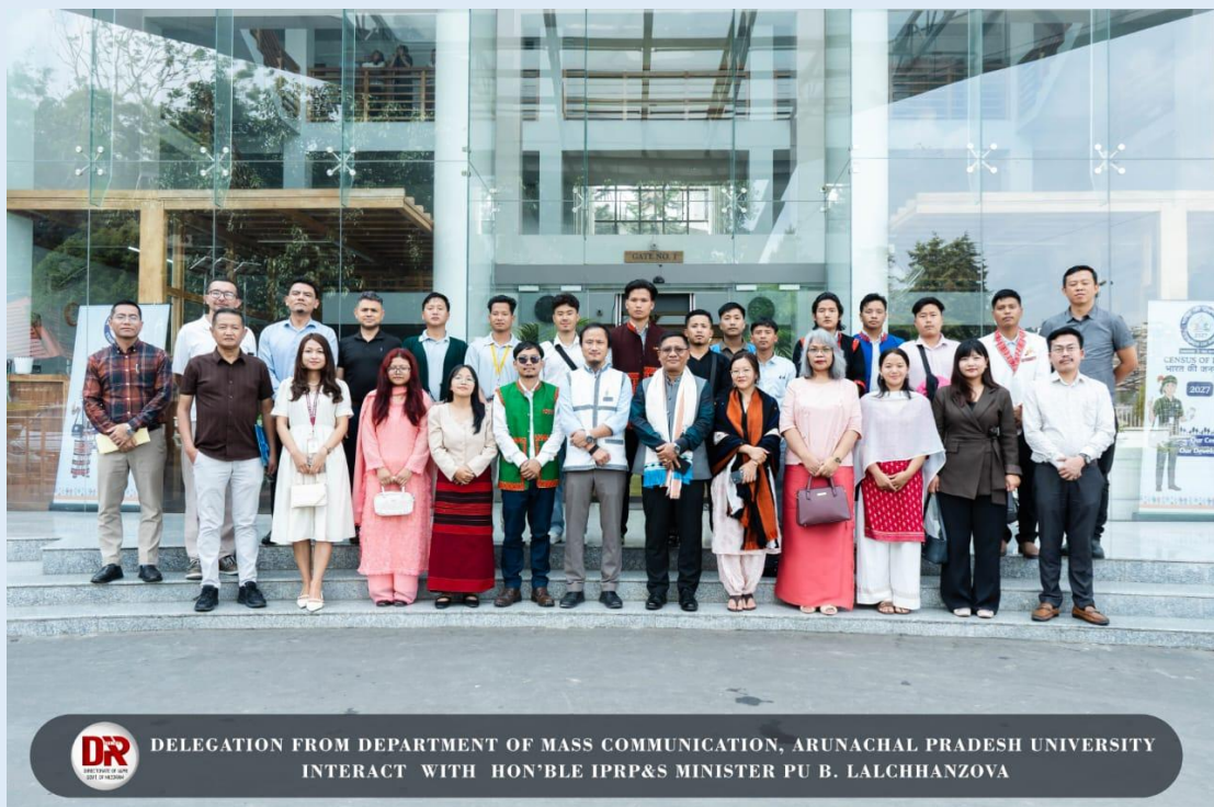
DELEGATION FROM DEPARTMENT OF MASS COMMUNICATION, ARUNACHAL PRADESH UNIVERSITY INTERACT WITH HON'BLE IPRP&S MINISTER PU B. LALCHHANZOVA