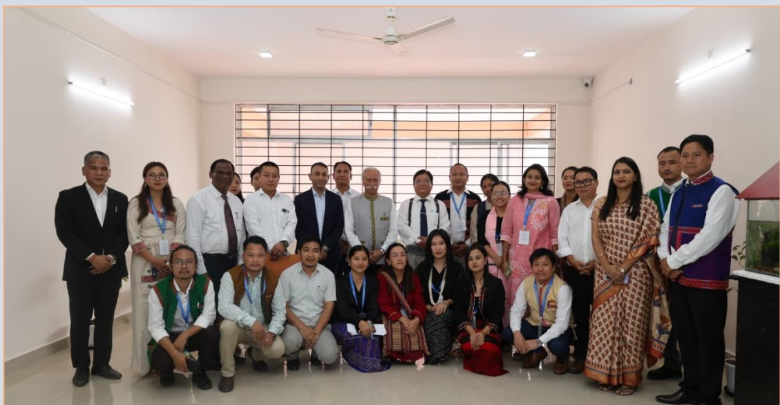
Hon'ble Chancellor, Commissioner Education, DC (East Siang) along with VC and members of APU Family