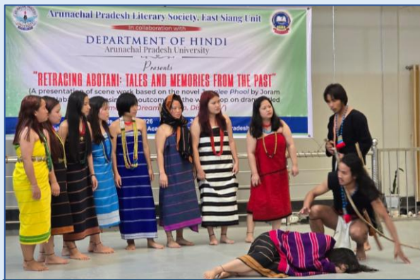
Theatre workshop conducted by Department of Hindi